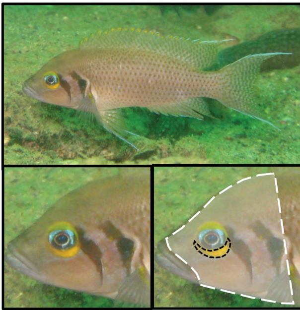
Figure 1 Image of Neolamprologus pulcher displaying the conspicuous yellow coloration on its face, as well as a diagram depicting how the size of these color patches was determined.